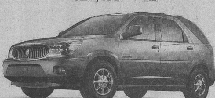
Stock numbers S536011, S535802, S523105, S528662, S522588

2003 Buick Rendezvous $30,200 MSRP — $2,515 discount — $2,250 rebate = $25,435* + ttl