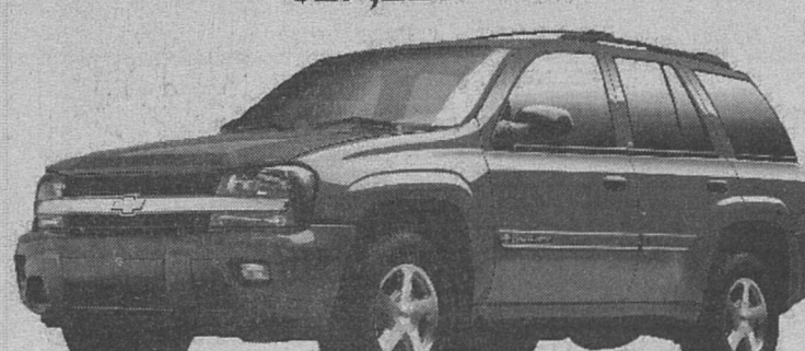
Stock numbers 6118733, 6119872, 6120212

2003 Chevy TrailBlazer EXT $34,365 MSRP — $2,640 discount — $2,500 rebate = $29,225* + ttl