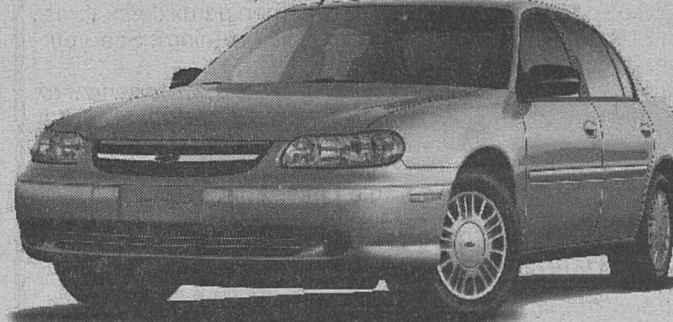
Stock numbers M571432, M587959

2003 Chevy Malibu $19,285 MSRP — $850 discount — $3,000 rebate = $15,435* + ttl