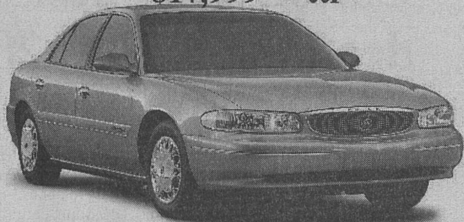
Stock #1151640, 1138421, 1146242, 1157577, 1127696

2003 Buick Century $22,230 MSRP — $1,231 discount — $3,000 rebate = $17,999* + ttl